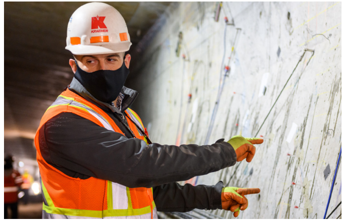
To continue to learn about how the bridge responds to different conditions, crews have been using an intelligent monitoring system at a section of the bridge with cracks.

The survey will be open until January 18, 2020 and is available in the following languages: English, Spanish, Somali, Khmer and Vietnamese through the following links below and on pages five and six: